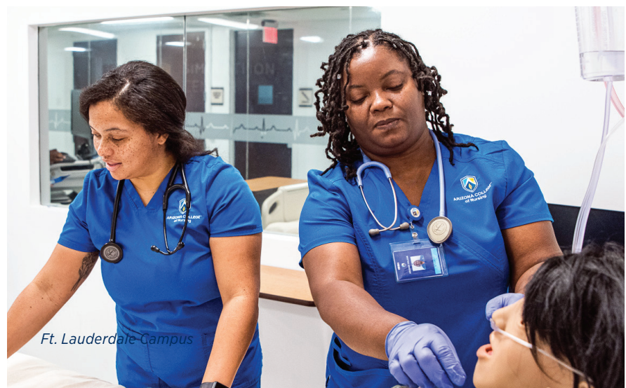
Ft. Lauderdale Campus

Satisfactory Academic Progress (SAP) is evaluated at the end of the semester for the College of Nursing. Students may challenge a grade for a period of thirty (30) days; after thirty (30) days, the grade becomes final as outlined in the college's Grievance Policy. For students transferring to a different program, only courses that apply to the new program will be calculated in Satisfactory Academic Progress.