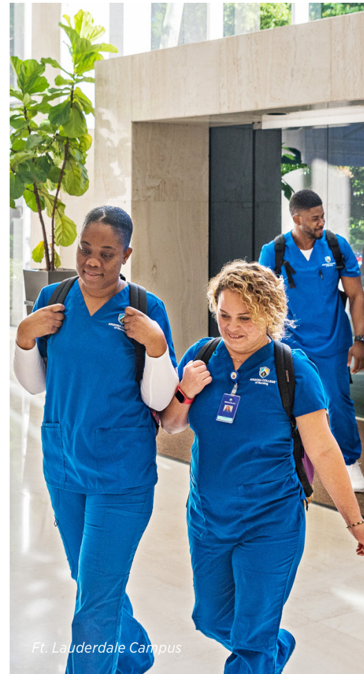
Ft. Lauderdale Campus

The "For Cause" substance screening applies to all Arizona College of Nursing students. Students are subject to screening if a staff member, faculty, and/or an agency staff member suspects the student is impaired at any time on campus or during any clinical experience or college-sponsored activity. This includes but is not