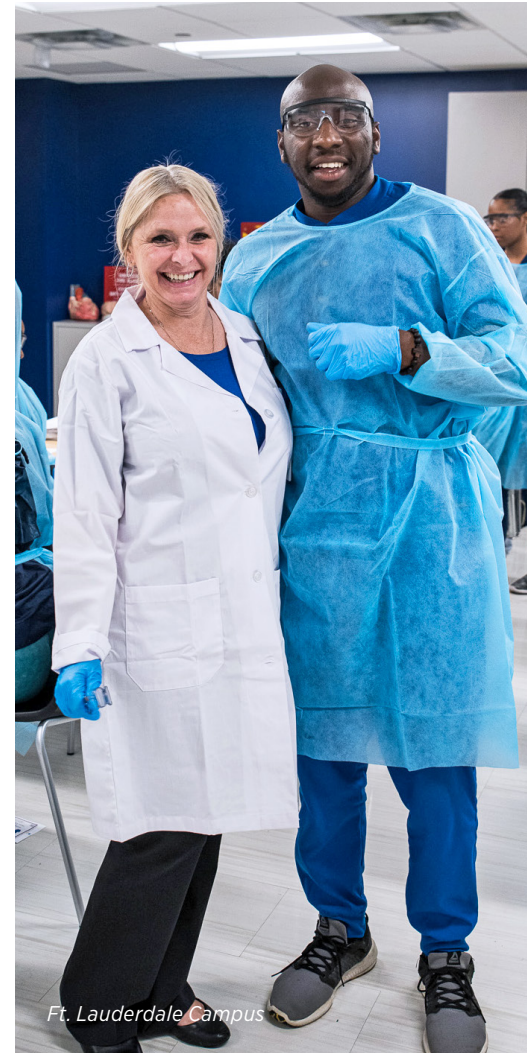
Ft. Lauderdale Campus

The Bachelor of Science in Nursing is approved by the governing body of Arizona College of Nursing.