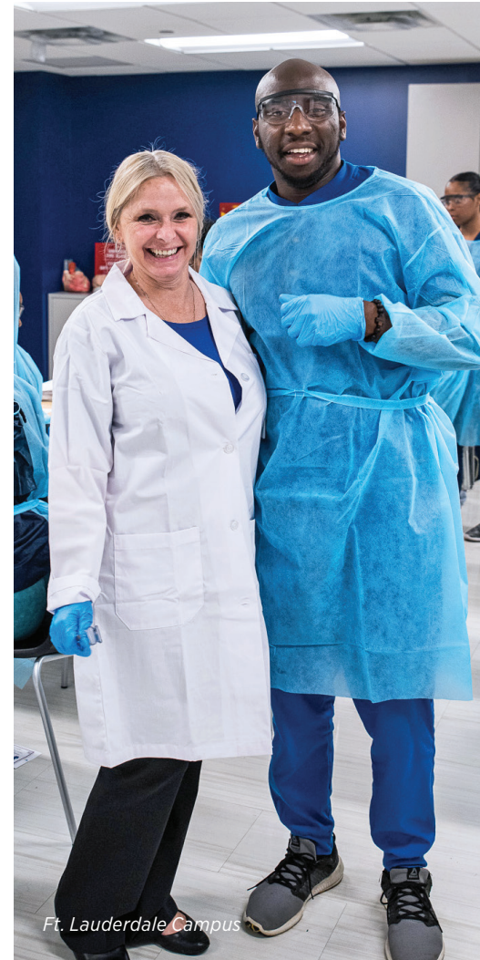
Ft. Lauderdale Campus

The Bachelor of Science in Nursing is approved by the governing body of Arizona College of Nursing.