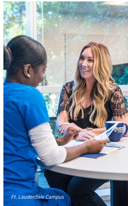
Ft. Lauderdale Campus

The amount of assistance that you have earned is determined on a pro-rata basis. For example, if you completed 30% of your payment period or period of enrollment, you earn 30% of the assistance you were originally scheduled to receive. If you do not begin attendance in all classes in a payment period, the amount of your Pell Grant and/or SEOG may have to be recalculated.