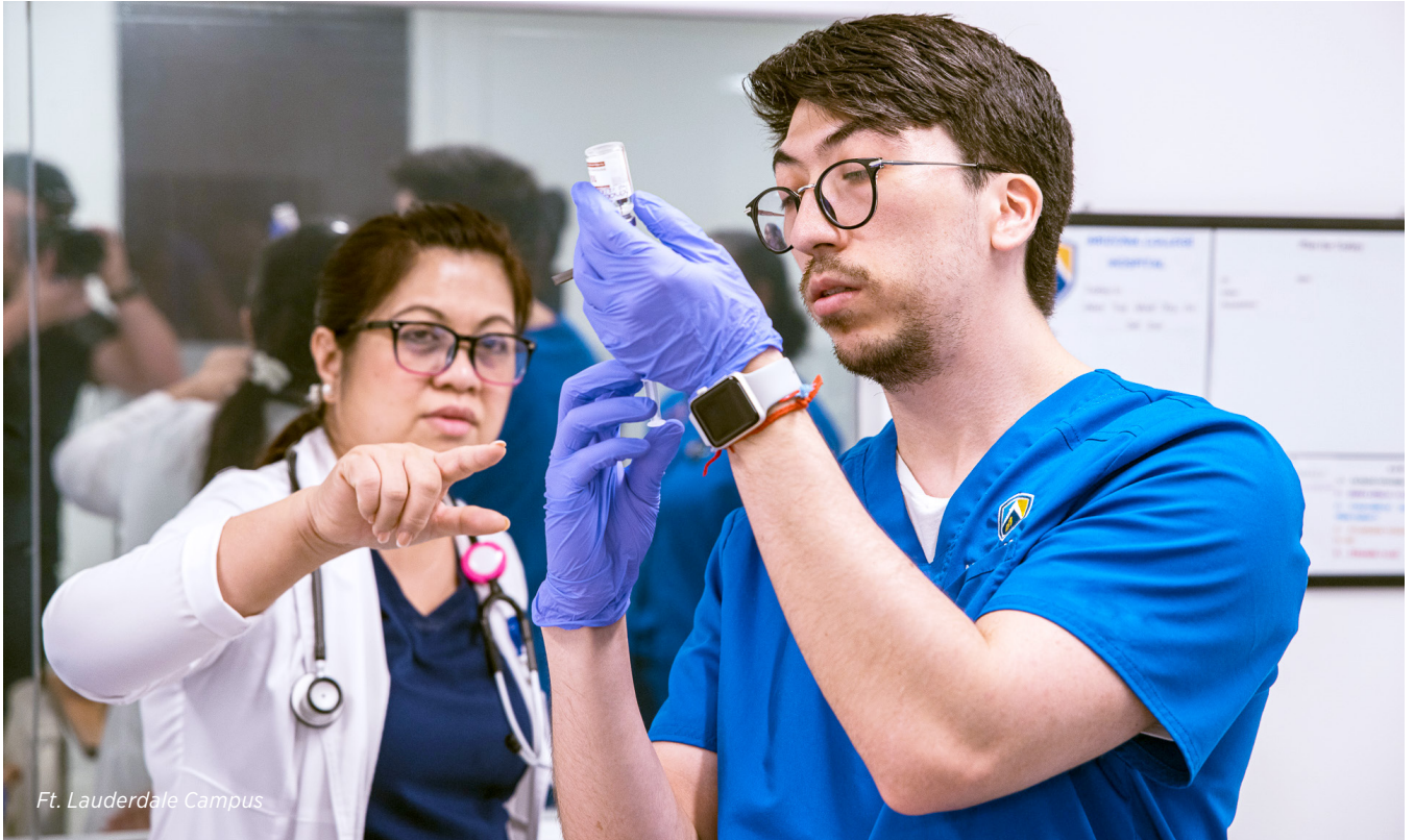
Ft. Lauderdale Campus