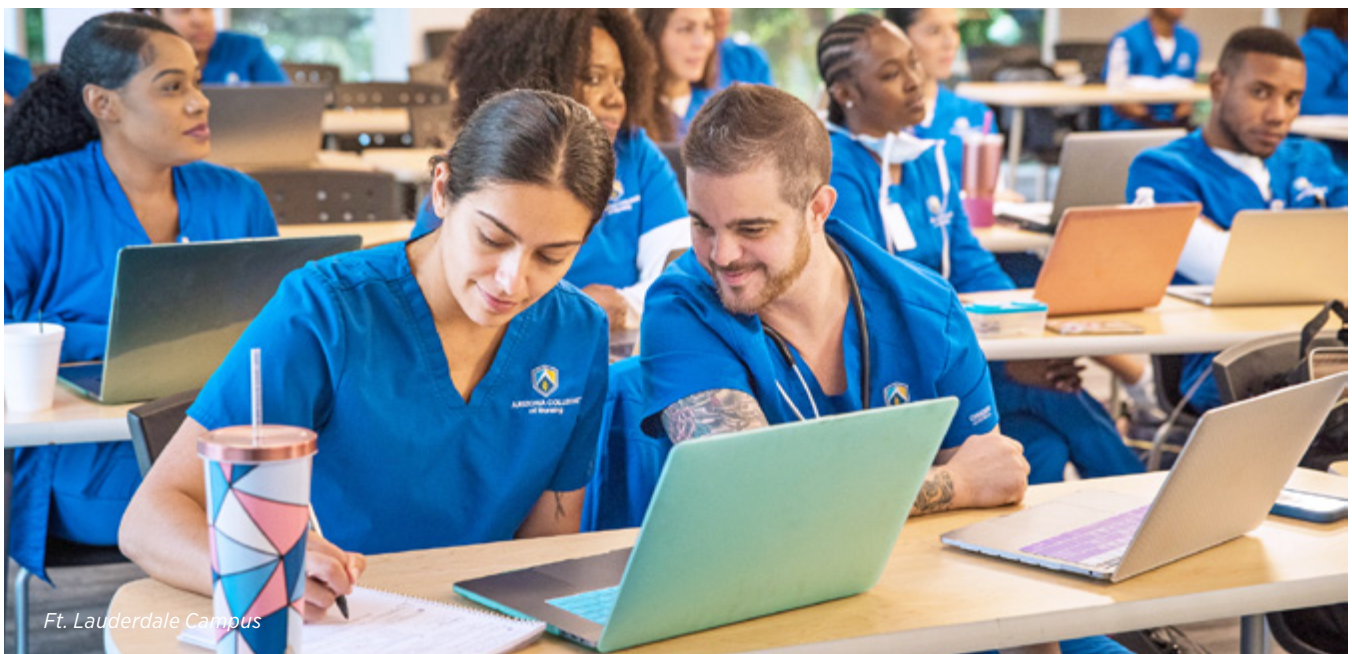
Ft. Lauderdale Campus

The Program offers a thirty (30)-semester unit option for licensed vocational nurses in California to become eligible to apply for RN licensure in accordance with California Regulation 1429 (a) (b) and (c). Applicants must convey their intent to enroll in this option at the time of application and present an unencumbered LVN license.