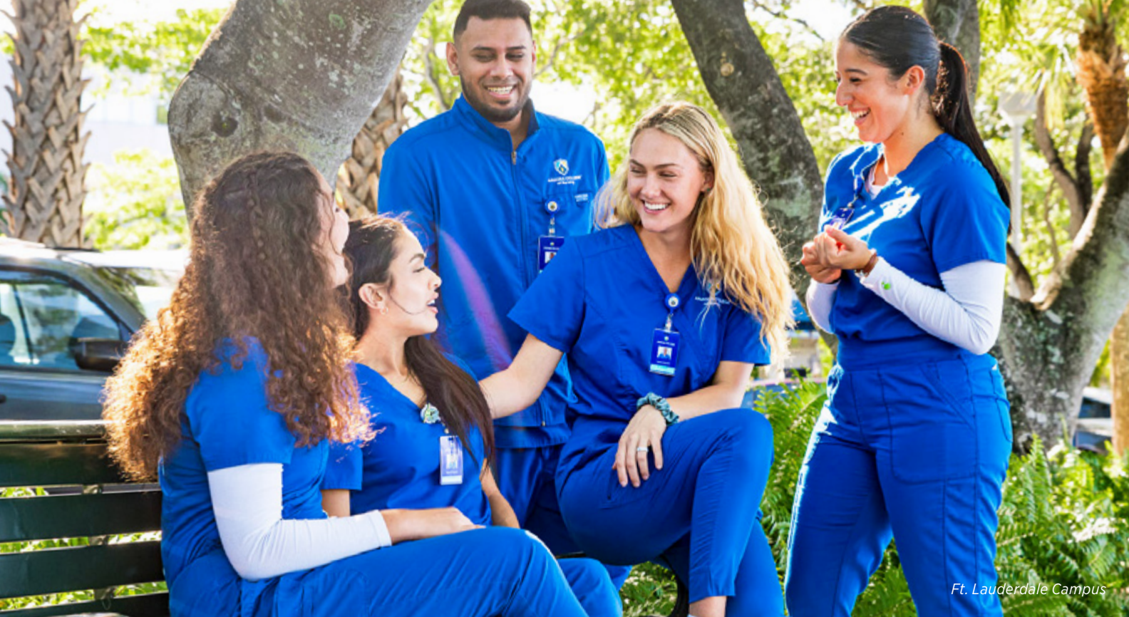
Ft. Lauderdale Campus