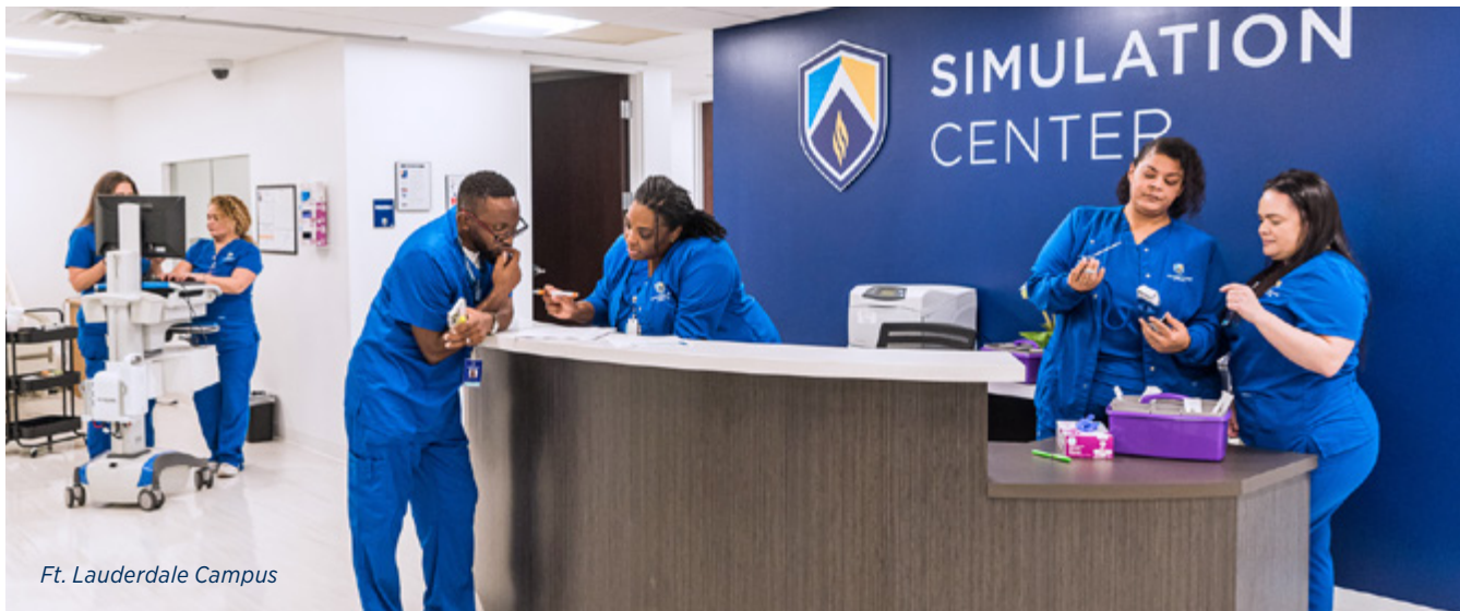
Ft. Lauderdale Campus