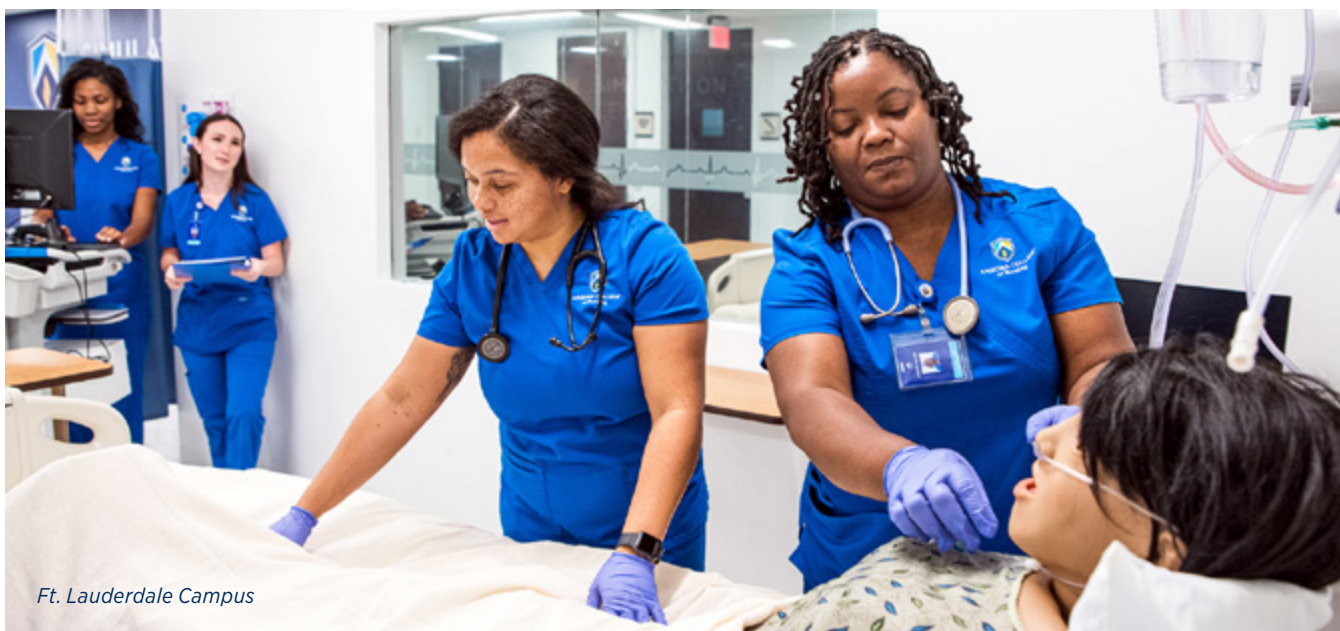
Ft. Lauderdale Campus