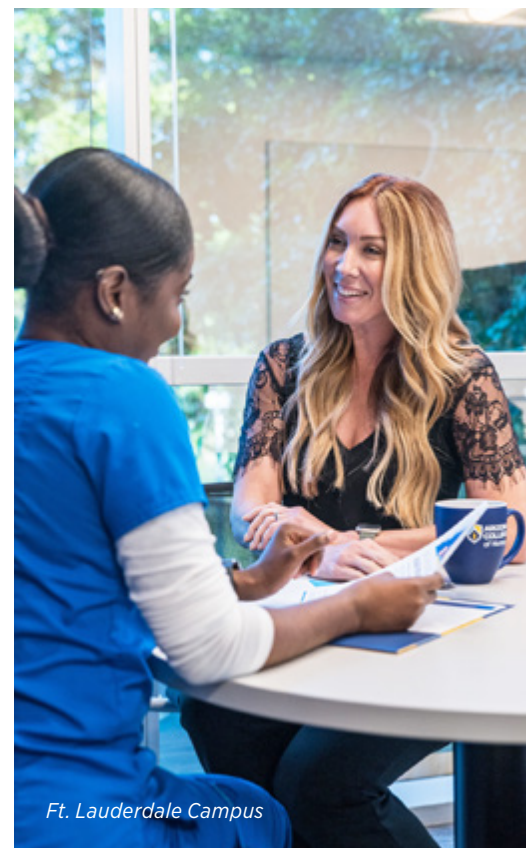
Ft. Lauderdale Campus

The amount of assistance that you have earned is determined on a pro-rata basis. For example, if you completed 30% of your payment period or period of enrollment, you earn 30% of the assistance you were originally scheduled to receive. If you do not begin attendance in all classes in a payment period, the amount of your Pell Grant and/or SEOG may have to be recalculated.