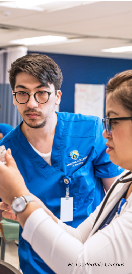
Ft. Lauderdale Campus

If you did not receive all of the funds that you earned, you may be due a post-withdrawal disbursement. If your post-withdrawal disbursement includes loan funds, your school must obtain your permission before it can disburse them. Arizona College of Nursing can disburse eligible grant funds without the student's permission for current charges, including tuition and fees, up to the amount of outstanding charges. Arizona College of Nursing will request your permission to use the post-withdrawal grant disbursement for any other charges.