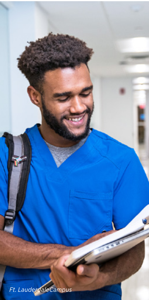
Ft. Lauderdale Campus