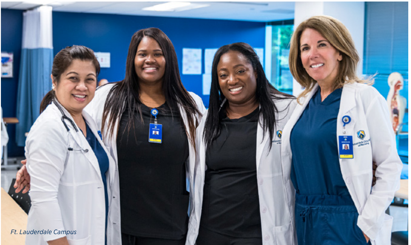
Ft. Lauderdale Campus