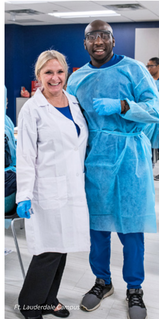
Ft. Lauderdale Campus

The core nursing curriculum (70* credit hours) is structured to build competencies in patient-centered care, evidence based practice, quality improvement, interprofessional teamwork, informatics and clinical reasoning to be used in the process of clinical judgment. Sound clinical judgment is the catalyst for all aspects of professional nursing care, which results in driving desired patient, systems and population outcomes.