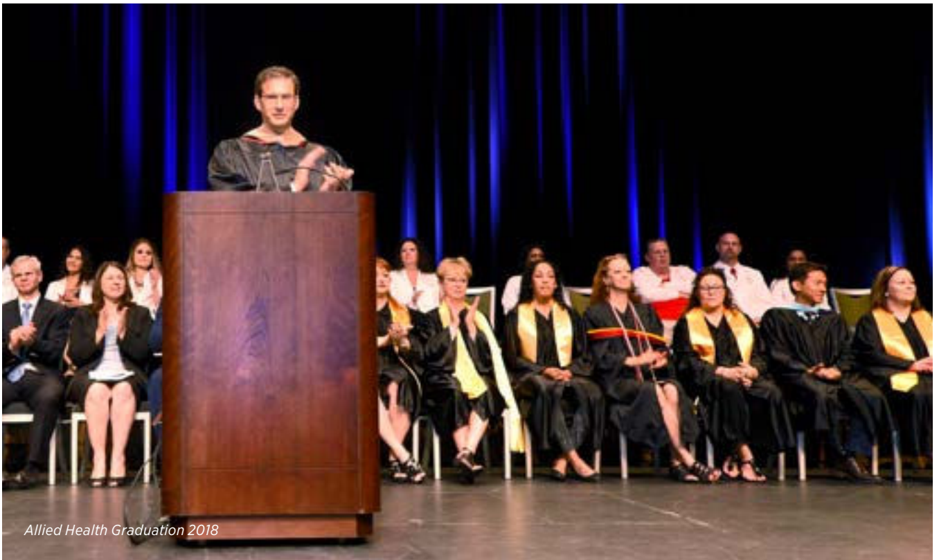
Allied Health Graduation 2018