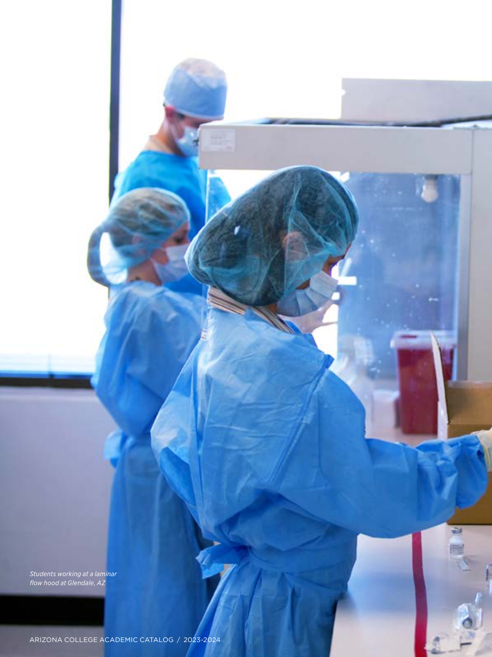
Students working at a laminar flow hood at Glendale, AZ