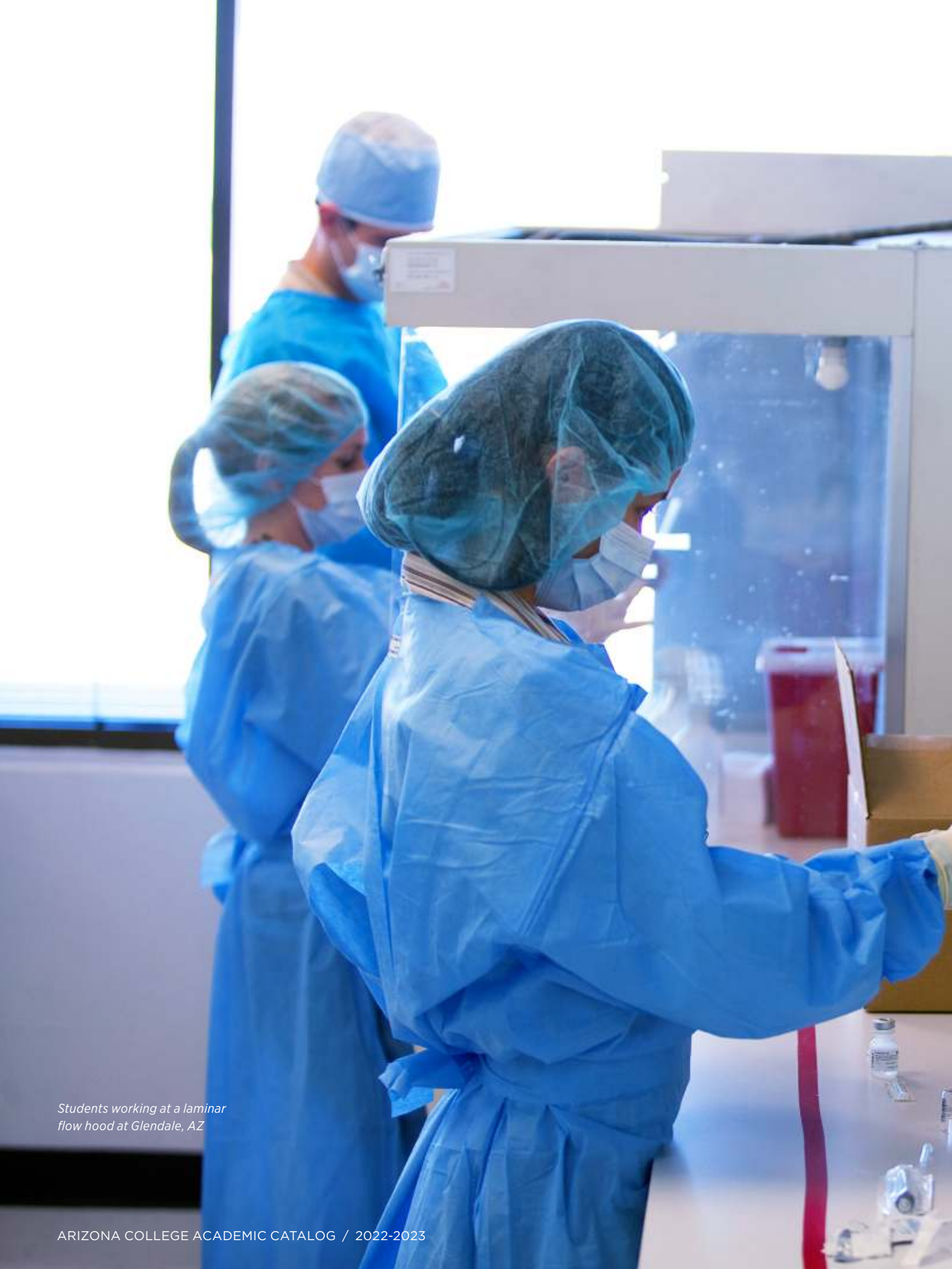
Students working at a laminar flow hood at Glendale, AZ